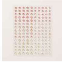
Strawberry Slush & Pretty In Pink Gems [165615]