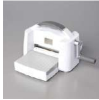
Stampin' Cut & Emboss Machine [149653]