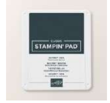
Secret Sea Classic Stampin' Pad [165285]