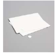
Stampin' Dimensionals [104430]