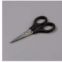
Paper Snips [103579]