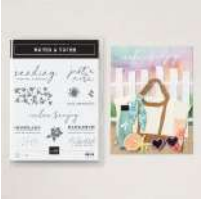
Notes & Totes Photopolymer Stamp Set (English) [165239]