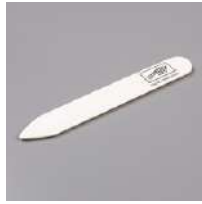
Bone Folder [102300]