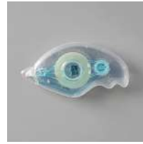
Stampin' Seal [152813]