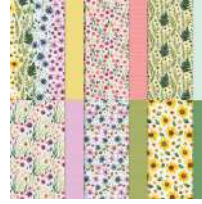
Floral Impressions 12" X 12" (30.5 X 30.5 Cm) Designer Series Paper [165603]