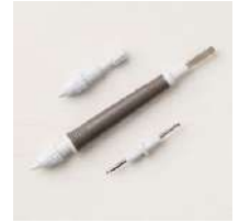
Take Your Pick [144107]