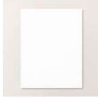
Basic White 8 1/2" X 11" Cardstock [166780]