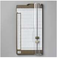
Paper Trimmer [152392]