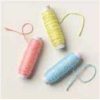
Baker's Twine Three Color Pack [162759]