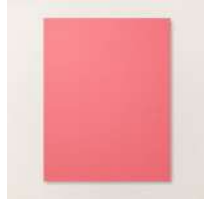
Strawberry Slush 8 1/2" X 11" Cardstock [165625]