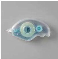
Stampin' Seal [152813]