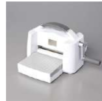
Stampin' Cut & Emboss Machine [149653]