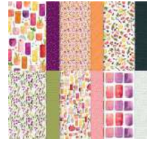
Celebratory Sips 12" X 12" (30.5 X 30.5 Cm) Designer Series Paper [165586]