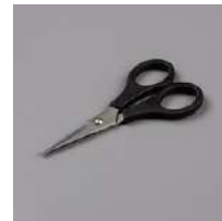
Paper Snips [103579]