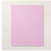
Fresh Freesia 8 1/2" X 11" Cardstock [155613]