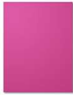
Berry Burst 8-1/2" X 11" Cardstock [144243]