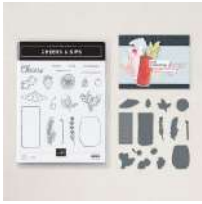
Cheers & Sips Bundle (English) [165594]