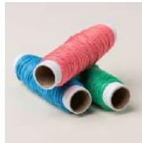
Pack Your Bags Twine Three Pack [165582]