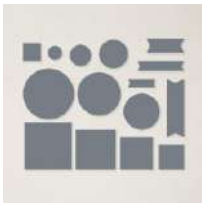
Stylish Shapes Dies [159183]