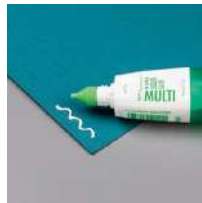
Multipurpose Liquid Glue [110755]