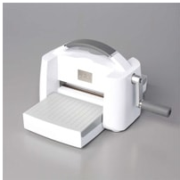
Stampin' Cut & Emboss Machine [149653]