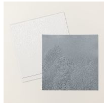
Pressed Flowers Embossing Folder [165614]