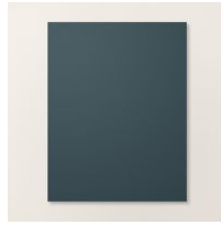
Secret Sea 8 1/2" X 11" Cardstock [165624]