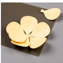
Silicone Craft Sheet [127853]