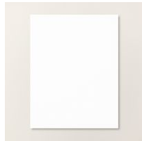
Basic White 8 1/2" X 11" Cardstock [166780]