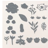
Pretty Florals Dies [165178]