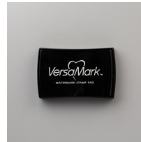
VersaMark Pad [102283]