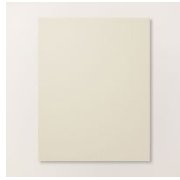
Basic Beige 8 1/2" X 11" Cardstock [164511]