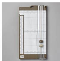
Paper Trimmer [152392]