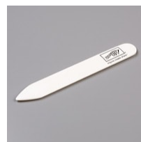
Bone Folder [102300]