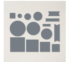
Stylish Shapes Dies [159183]