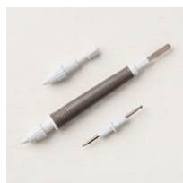
Take Your Pick [144107]