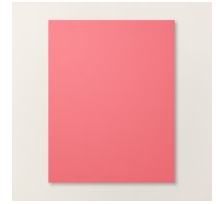
Strawberry Slush 8 1/2" X 11" Cardstock [165625]