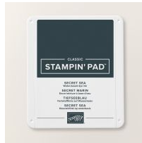
Secret Sea Classic Stampin' Pad [165285]