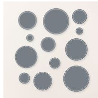
Spotlight On Nature Dies [163580]