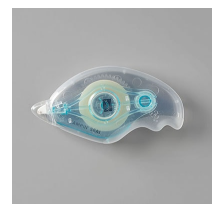
Stampin' Seal [152813]