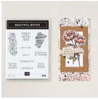
Beautiful Motifs Photopolymer Stamp Set (English) [165198]