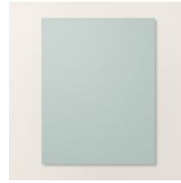
Cloud Cover 8 1/2" X 11" Cardstock [165621]