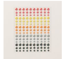
2025-2027 In Color™ Flat Pearls [165192]