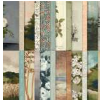
Beautiful Gallery 6" X 6" (15.2 X 15.2 Cm) Designer Series Paper [165196]