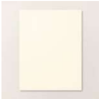
Very Vanilla 8 1/2" X 11" Cardstock [166784]