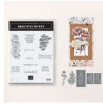
Beautiful Motifs Bundle (English) [165206]