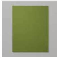
Mossy Meadow 8-1/2" X 11" Cardstock [133676]