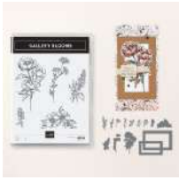
Gallery Blooms Bundle [165213]