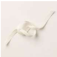
Basic Beige 3/8" (1 Cm) Classic Ribbon [165216]