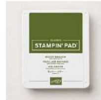
Mossy Meadow Classic Stampin' Pad [147111]