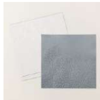
Pressed Flowers Embossing Folder [165614]