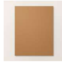
Pecan Pie 8 1/2" X 11" Cardstock [161717]