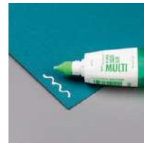
Multipurpose Liquid Glue [110755]