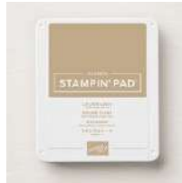
Crumb Cake Classic Stampin' Pad [147116]