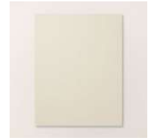
Basic Beige 8 1/2" X 11" Cardstock [164511]