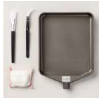
Embossing Additions Tool Kit [159971]