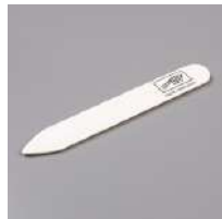
Bone Folder [102300]