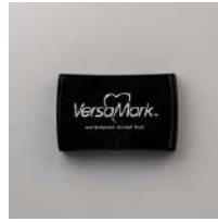
VersaMark Pad [102283]