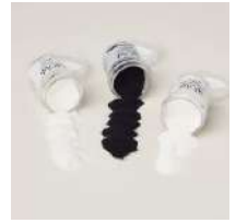
Basics Wow! Embossing Powder [165679]