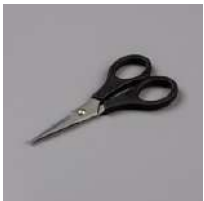
Paper Snips [103579]