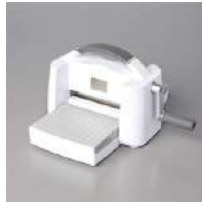
Stampin' Cut & Emboss Machine [149653]