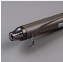
Heat Tool (Us And Canada) [129053]