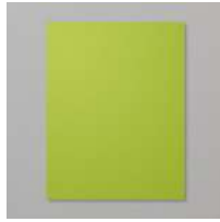
Granny Apple Green 8- 1/2" X 11" Cardstock [146990]