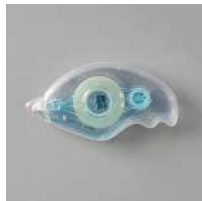
Stampin' Seal [152813]