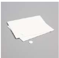
Stampin' Dimensionals [104430]