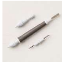
Take Your Pick [144107]