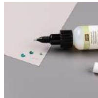
Fine-Tip Glue Pen [138309]