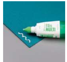
Multipurpose Liquid Glue [110755]