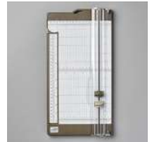
Paper Trimmer [152392]