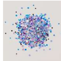
Itty Bitty Bokeh Mix [164618]