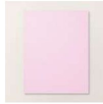
Bubble Bath 8 1/2" X 11" Cardstock [161718]