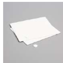
Stampin' Dimensionals [104430]