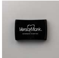
VersaMark Pad [102283]