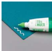
Multipurpose Liquid Glue [110755]