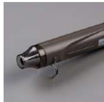
Heat Tool (Us And Canada) [129053]