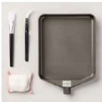
Embossing Additions Tool Kit [159971]