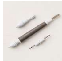
Take Your Pick [144107]