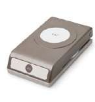
1-3/4" (4.4 Cm) Circle Punch [119850]