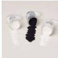
Basics Wow! Embossing Powder [165679]