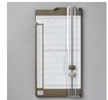
Paper Trimmer [152392]