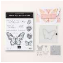
Beautiful Butterflies Bundle (English) [164615]