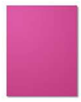
Berry Burst 8-1/2" X 11" Cardstock [144243]