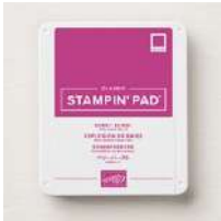
Berry Burst Classic Stampin' Pad [147143]