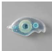
Stampin' Seal [152813]