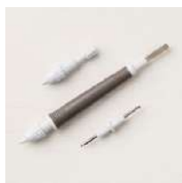
Take Your Pick