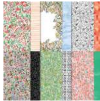
Mixed Media Florals 12" X 12" (30.5 X 30.5 Cm) Designer Series Paper [I64638]