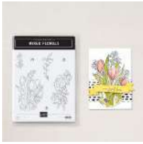
Mixed Florals Photopolymer Stamp Set [I64639]