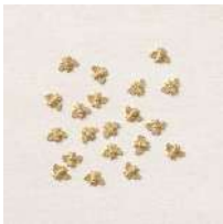
Bumblebee Trinkets [I55568]