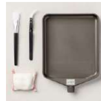
Embossing Additions Tool Kit [I59971]