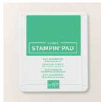
Shy Shamrock Classic Stampin' Pad [I63808]