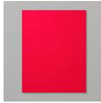
Poppy Parade 8-1/2" X 11" Cardstock [I19793]