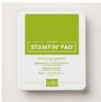
Granny Apple Green Stampin' Pad [I47095]