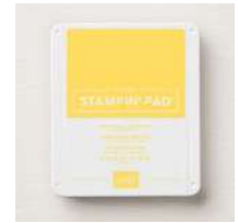
Daffodil Delight Classic Stampin' Pad [I47094]