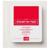
Poppy Parade Classic Stampin' Pad [I47050]