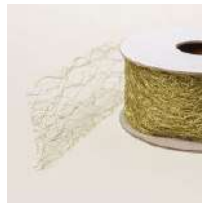
Gold 1 1/2" (3.8 Cm) Open Weave Trim [I65715]