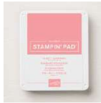
Flirty Flamingo Classic Stampin' Pad [I47052]