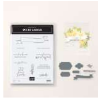
Mixed Labels Bundle (English) [I64653]