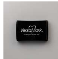
Versamark Pad [I02283]