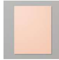
Petal Pink 8-1/2" X 11" Cardstock [I46985]