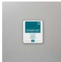
Pretty Peacock Classic Stampin' Pad [I50083]