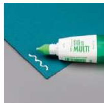
Multipurpose Liquid Glue [I10755]