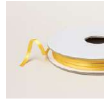
Daffodil Delight 1/8" (3.2 Mm) Satin Ribbon [I64715]