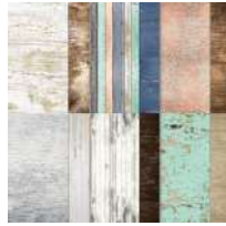
Country Woods 12" X 12" (30.5 X 30.5 Cm) Designer Series Paper [I63393]