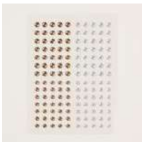
Pecan Pie & Clear Ribbonded Adhesive Backed Dots [I64204]