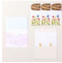
Washes & Florals Tags Mix & Match Ephemera Pack [I64859]