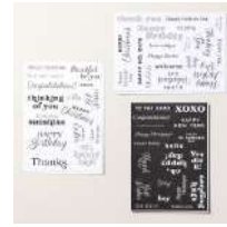
Greetings For All Mix & Match Ephemera Pack (English) [I64862]