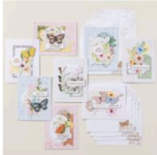
Heirloom Arrangements Kit (English) [165007]

all supplies can be purchased in my online store find at www.kaylarenee.com