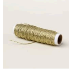
Gold Twisted Thread [164603]