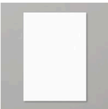
Basic White A4 Thick Cardstock [159230]