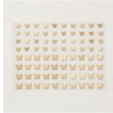
Brushed Brass Butterflies [158136]