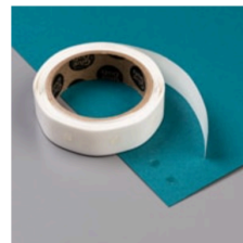
Mini Glue Dots [103683]