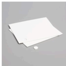
Stampin' Dimensionals [104430]