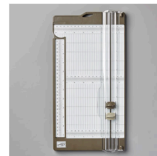
Paper Trimmer [152392]