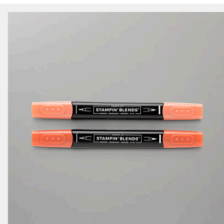
Cajun Craze Stampin' Blends Combo Pack [154879]