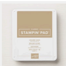
Crumb Cake Classic Stampin' Pad [147116]