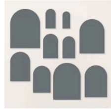
Everyday Arches Dies [164629]