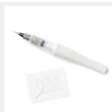
Clear Wink Of Stella Glitter Brush [141897]