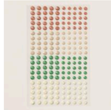
Earth Tones Shimmer Gems [164070]