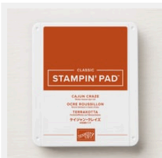
Cajun Craze Classic Stampin' Pad [147085]