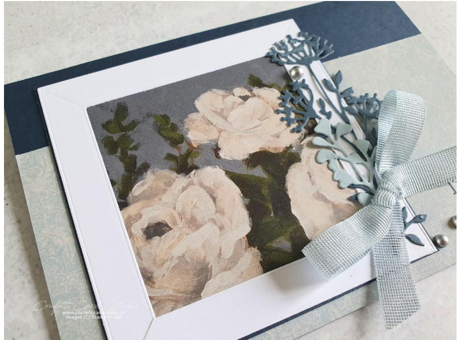
Beautiful Gallery Sympathy Card By Vanessa Baker

All supplies for this project can be purchased in my online store, you can add all items to your cart and then remove what you don't need.