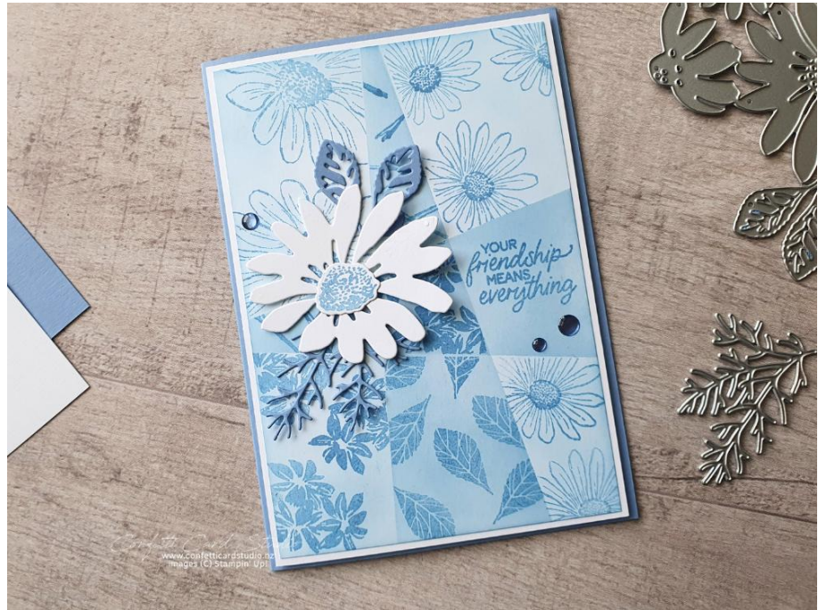
Boho Blue Retiform Cheerful Daisies Card By Vanessa Baker

All supplies can be purchased in my online store, this project is Retiform Technique Cheerful Daisies Card. You can add all items to your cart and then remove what you don't need.