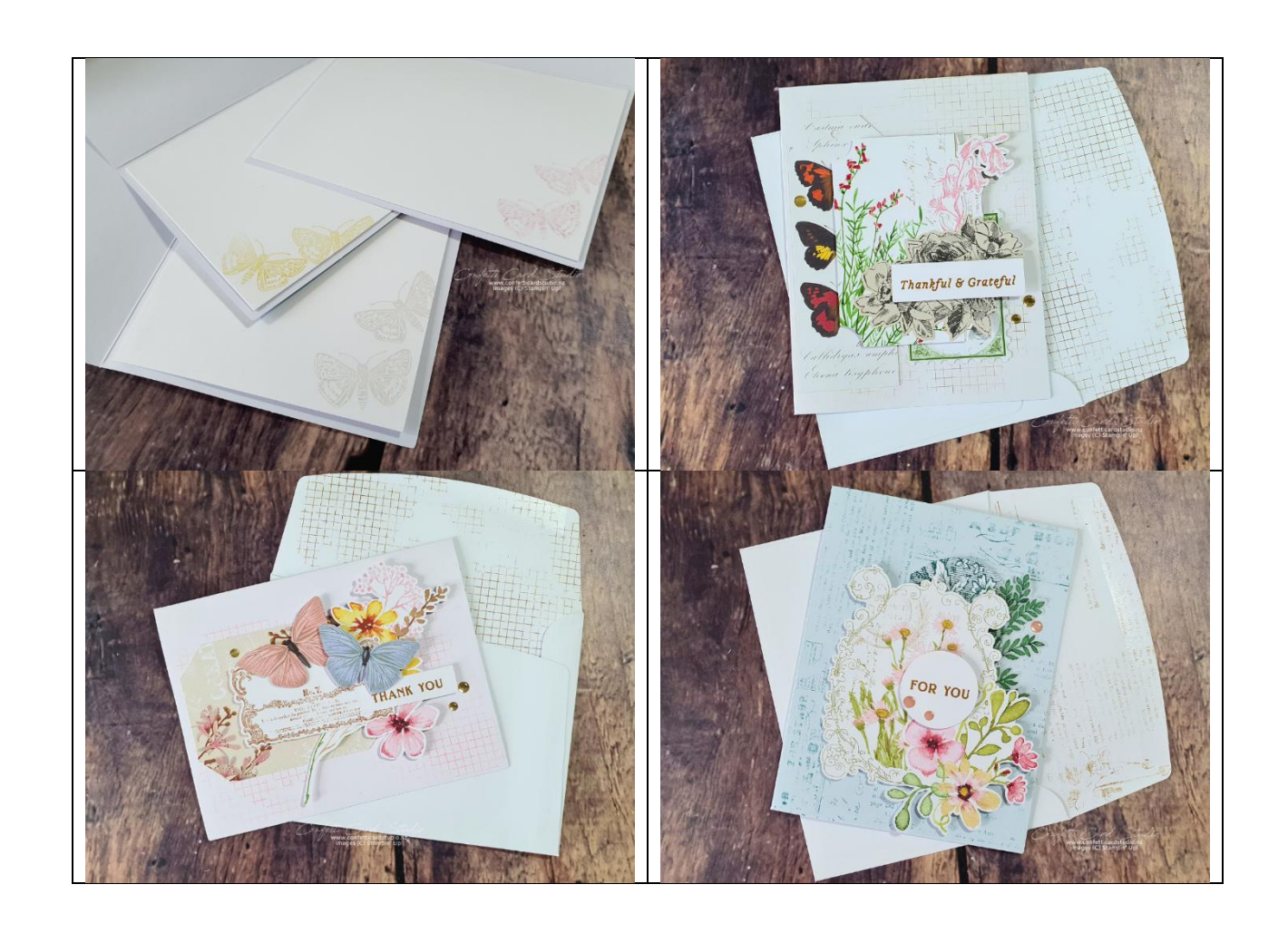
Video Tutorial Click below

Heirloom Arrangements Kit Cards Tutorial Video