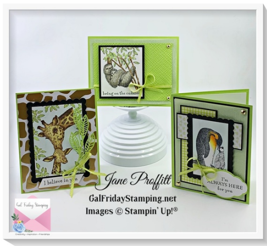
CARD # 1