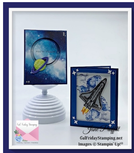
CARD # 1