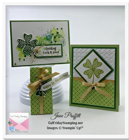
CARD # 1