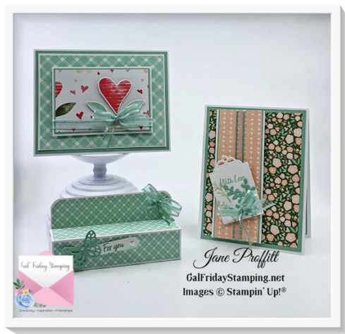
CARD # 1