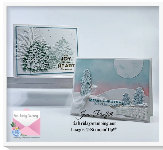
CARD # 1