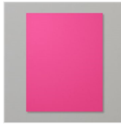
Melon Mambo 8- 1/2" X 11" Cardstock - 115320