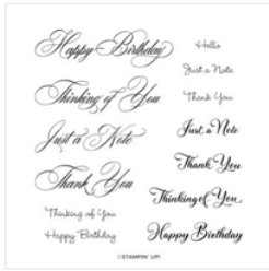
Go To Greetings Cling Stamp Set (English) - 158763