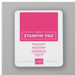
Melon Mambo Classic Stampin' Pad - 147051