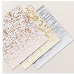
Naturally Gilded 12" X 12" (30.5 X 30.5 Cm) Specialty Designer Series Paper - 161639