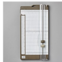
Paper Trimmer - 152392