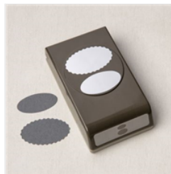
Double Oval Punch - 154242