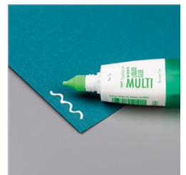
Multipurpose Liquid Glue - 110755