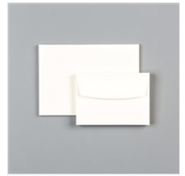
Very Vanilla Note Cards & Envelopes - 144236