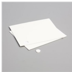
Stampin' Dimensionals - 104430