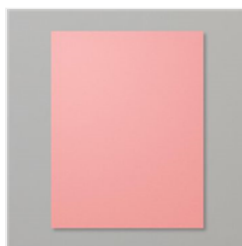
Flirty Flamingo 8- 1/2" X 11" Cardstock - 141416