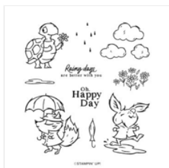
Playing In The Rain Cling Stamp Set (English) - 160542