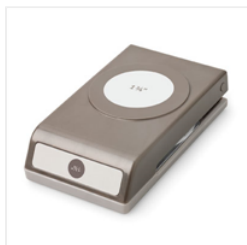
1-3/4" (4.4 Cm) Circle Punch - 119850