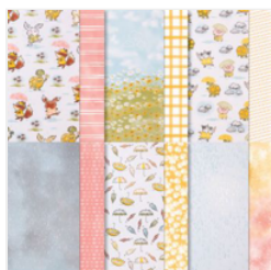
Rain Or Shine Specialty 12" X 12" (30.5 X 30.5 Cm) Designer Series Paper - 160540