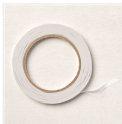
Tear & Tape Adhesive - 154031