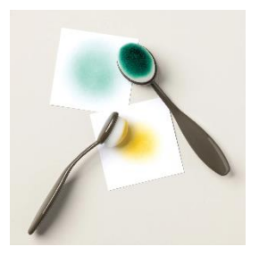
153611 Blending Brushes