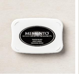
132708 Memento Tuxedo Black ink