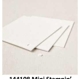
144108 Mini Stampin' Dimensionals