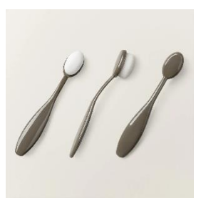
160518 Small Blending Brushes

The following is a list of supplied items that you will certainly want to have in order to complete more cards.