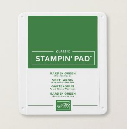
147089 Garden Green ink 159210 Tahitian Tide ink 147113 Smoky Slate ink