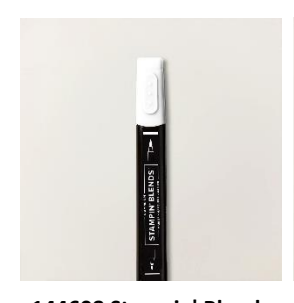
144608 Stampin' Blends Color Lifter