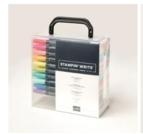
147154 Many Marvelous Markers