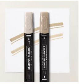
154882 Crumb Cake Blends